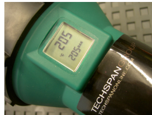
Digital temp display 'set & actual' Adjustment via Potentiometer