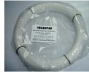
See Rod Catalog LEPLFIX