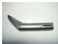
Tacking Tip LE106996