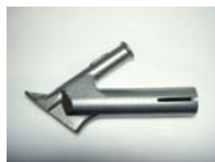
Speed Nozzle 4mm LE106990