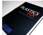
Plastics Fix Book LEPLFIX