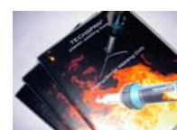
Training DVD LEDVD