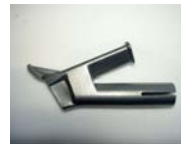
Speed Nozzle 5tri. LE106992