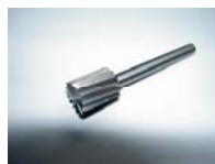
Rotary Burr LE106997