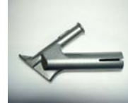
Speed Nozzle 5mm LE106991