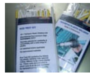
Rod Test Kit RTK