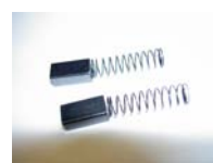
Motor Brushes LE6601013