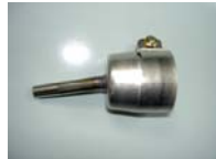
Welding Nozzle LE100303