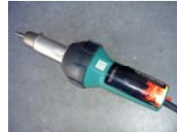
Rion Digital LE6600070