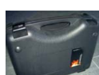
Tool Case LETPWC