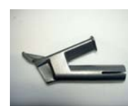
Speed Nozzle 7tri. LE106993